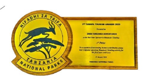
Tanzania's Leading Tour Operator (Mountain Trekking)